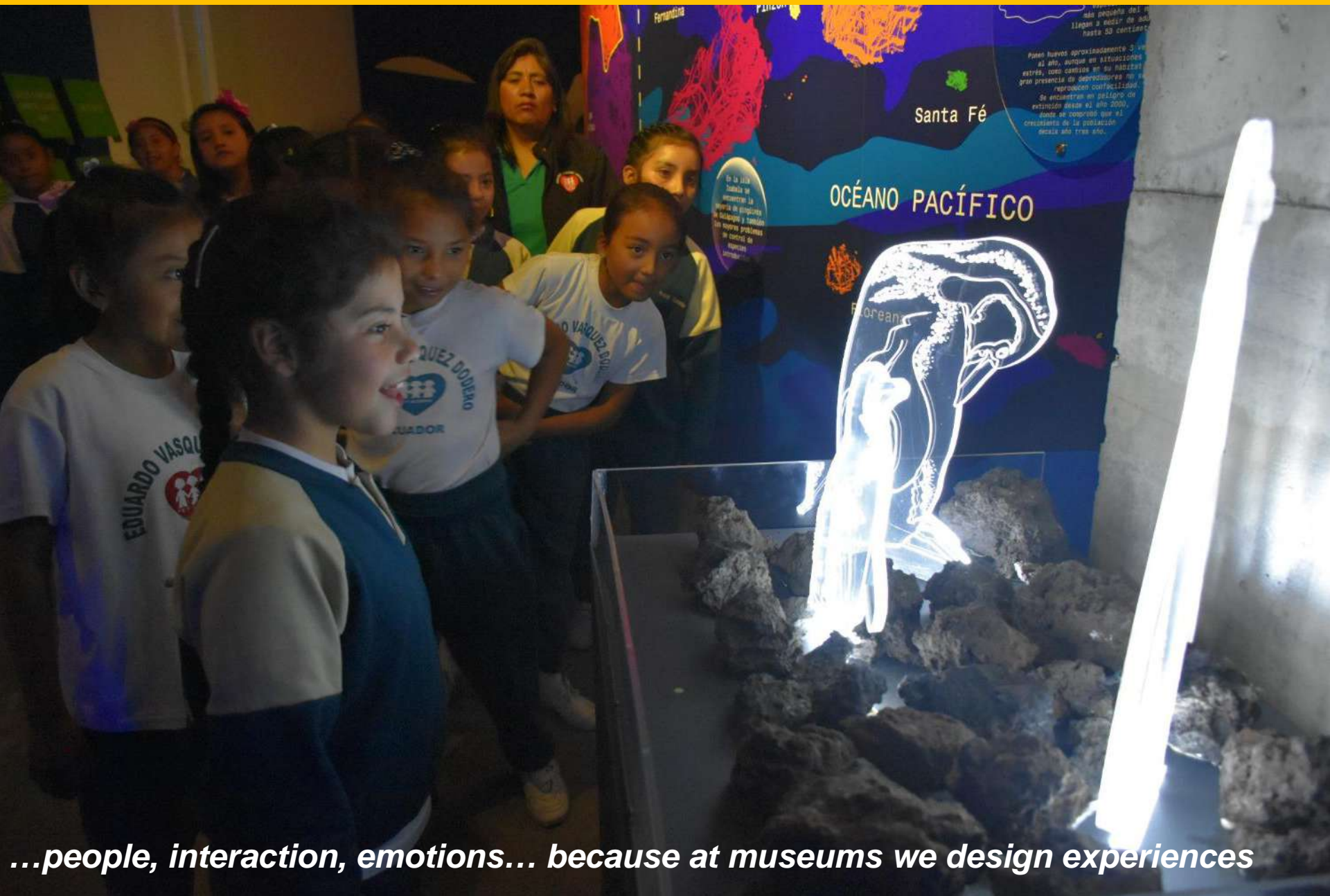
...people, interaction, emotions... because at museums we design experiences